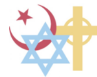
Religion / Belief