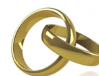
Marriage / Civil Partnership