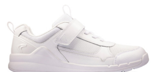
Plain black, white or grey trainers