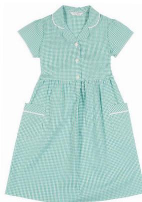
Green gingham checked summer dress