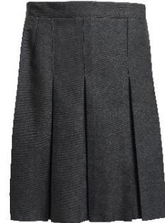
Charcoal grey trousers, skirt or pinafore