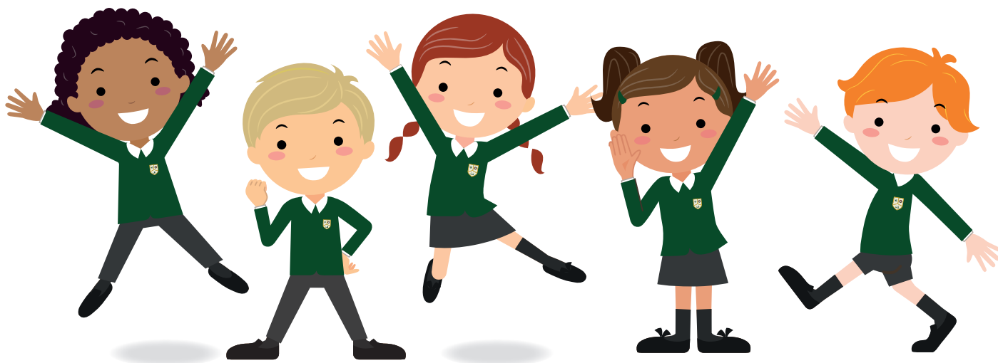
Head of Primary