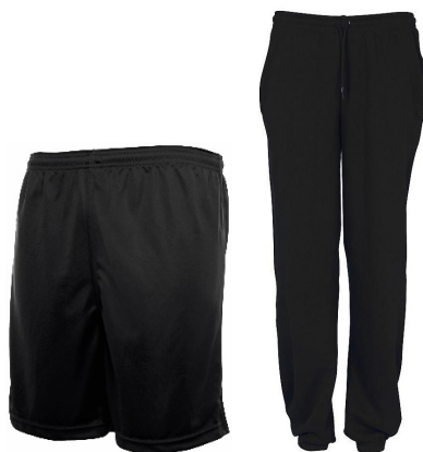
Black shorts/black tracksuit bottoms or leggings