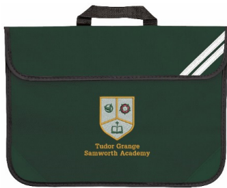
EYFS book bag*