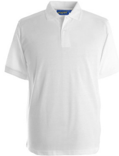
White polo shirt