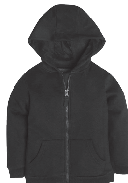
Black hoodie or fleece