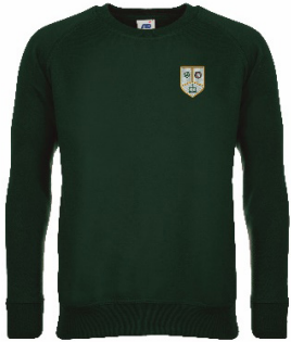
TGSA green jumper with white shield*