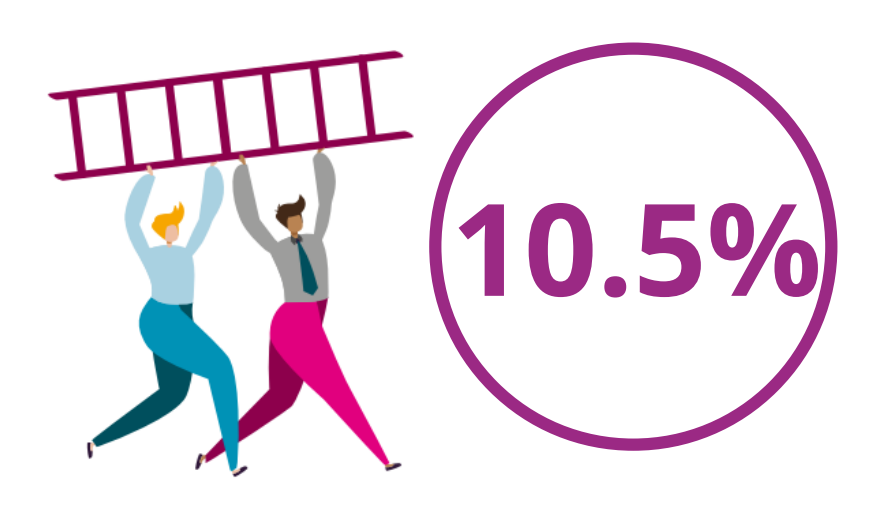
70,200 people in the region are self-employed