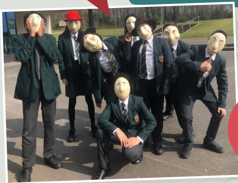
Year 8 Drama club exploring mask work