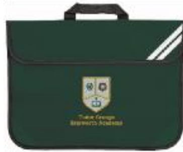
Primary book bag*