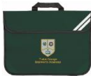
Primary book bag*